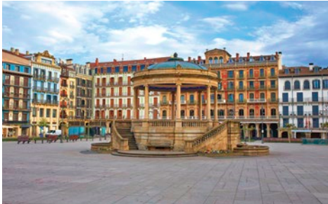
Above left: San Sebastián | Above: Pamplona