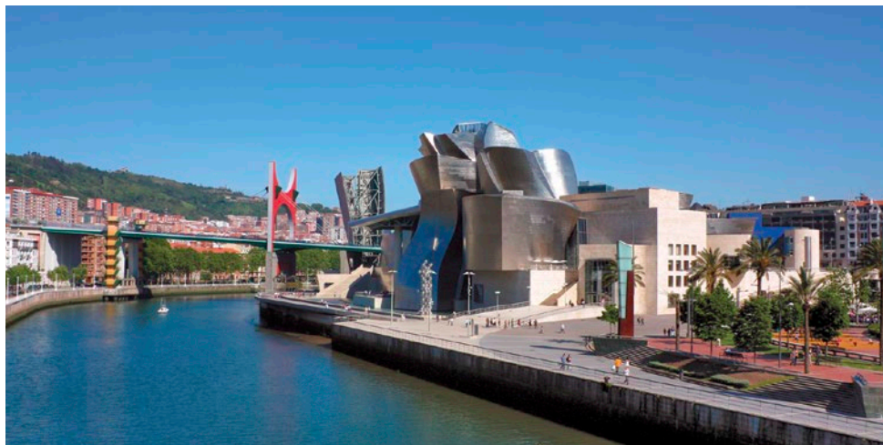
Guggenheim Museum, Bilbao

Pamplona. With a guide, meander down the town's atmospheric streets, where the chaotic Running of the Bulls occurs each July during the festival of San Fermin. See the bullfighting ring, Castle Square and the Gothic cathedral.