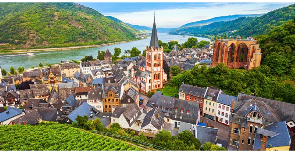
Upper Middle Rhine Valley

(At an additional cost. See website for details.)