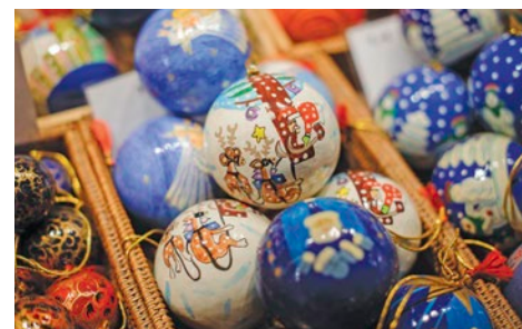
Above left: Heidelberg | Above: Traditional ornaments