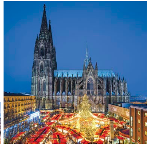
Cologne Cathedral and market