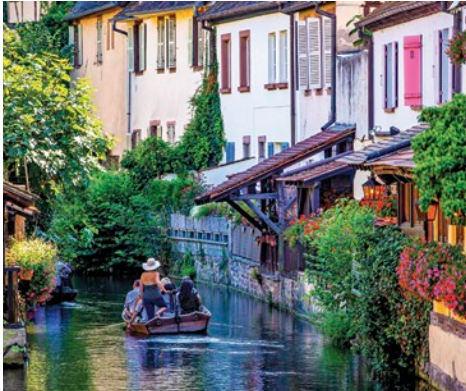
Above left: Strasbourg | Above: Colmar