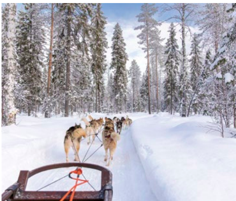
Above left: Northern Lights Village | Above: Dogsledding

Flights ✈ and transfers 🚗 provided for AHI FlexAir participants. Note: Itinerary may change due to local conditions.