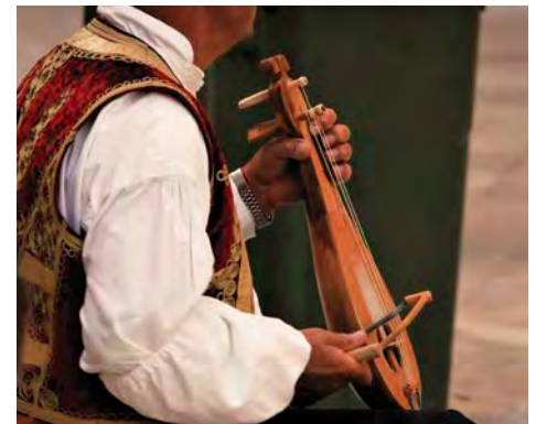
Traditional Croatian musician

AHI FlexAir | Our personalized air program features transfers, assistance and flexibility.