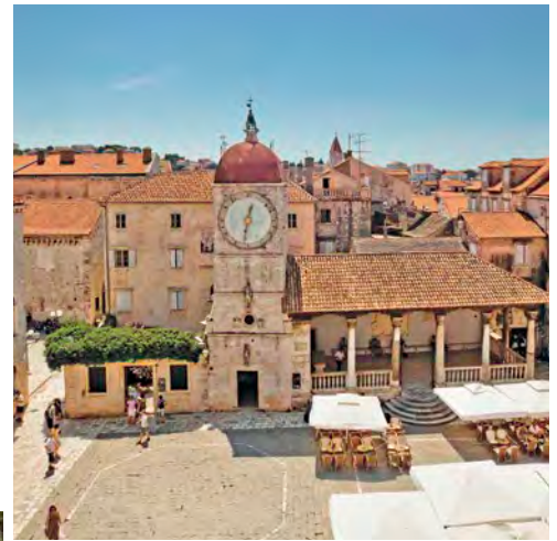
Old town, Trogir